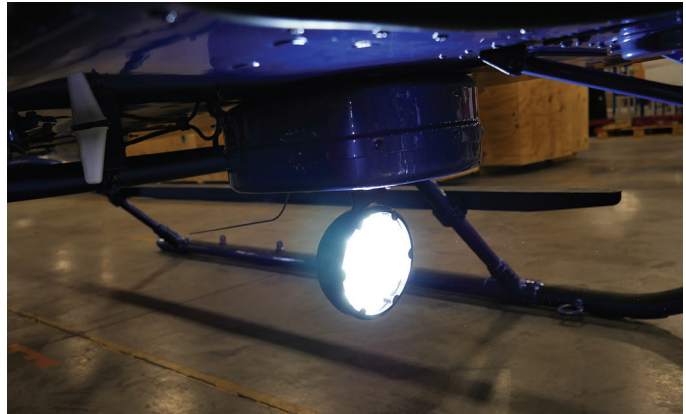
LED NIGHTSCANNER (PAR 46) vs. SUPER NIGHTSCANNER (PAR 64) (LEFT) (RIGHT)