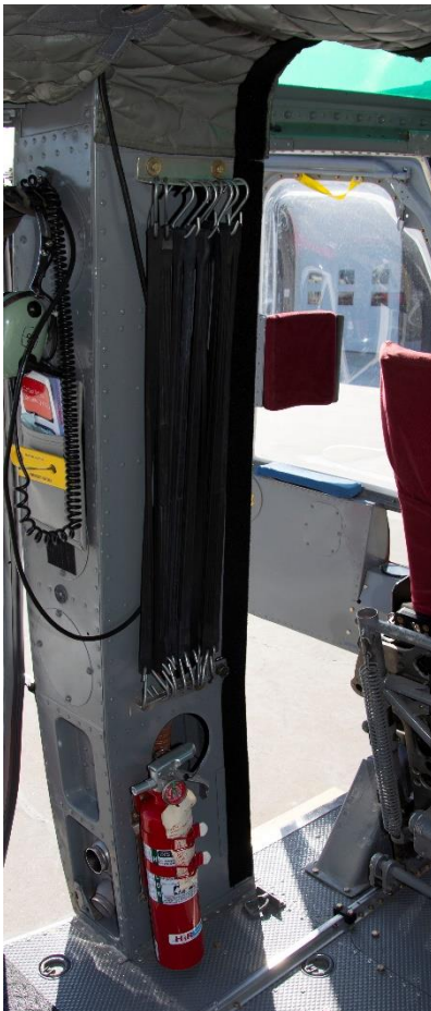
Figure 1 LHS Velcro, Detail (Item 2) Shown

The method shown in the following instructions should be considered optimal, but variation to accommodate existing aircraft configurations are permissible.