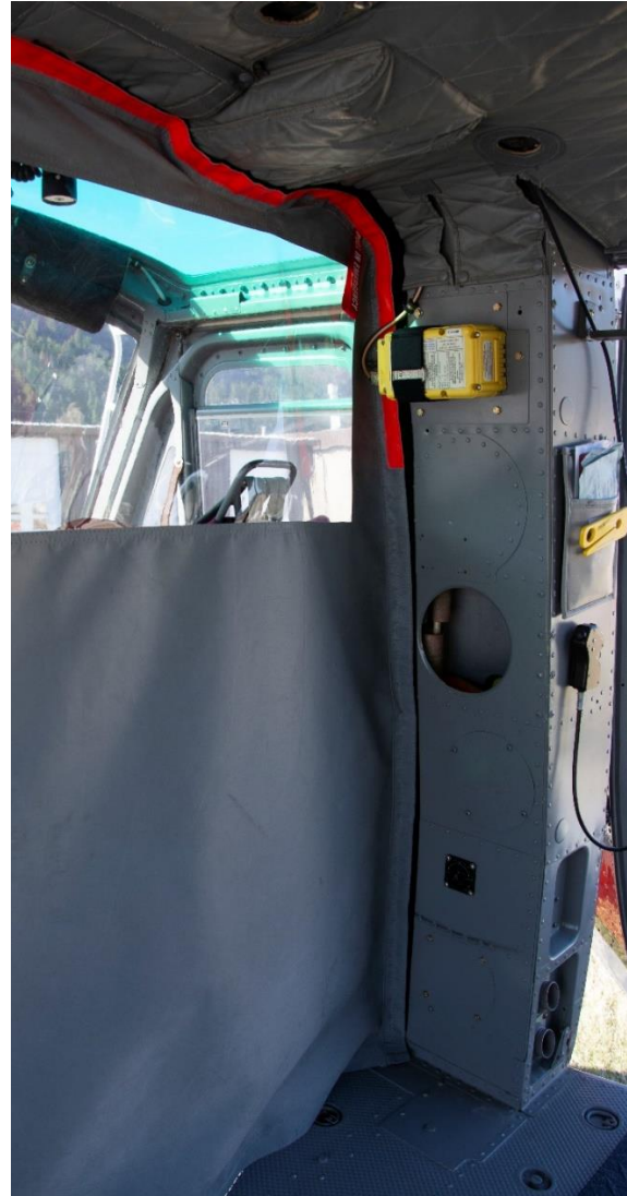
Figure 6 RHS Crew Barrier, Assy (Item 1) Shown