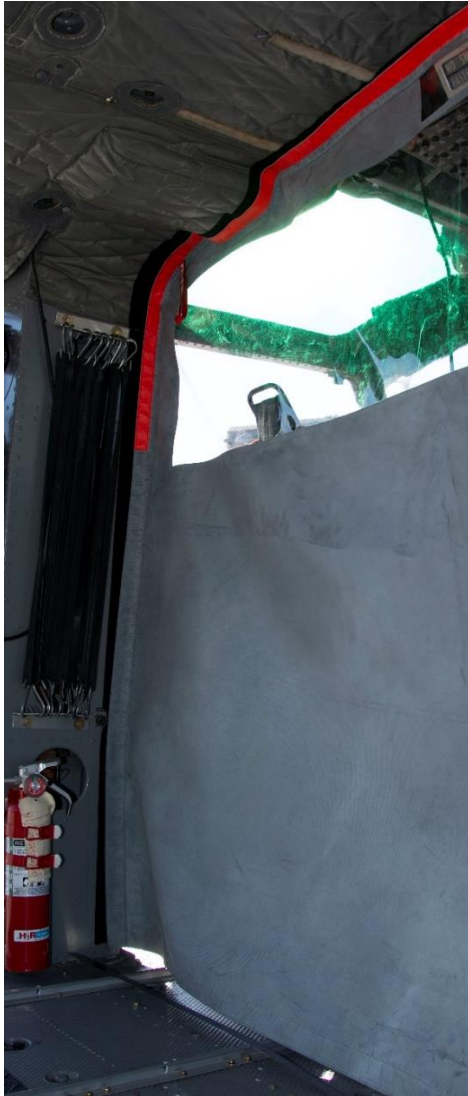
Figure 5 LHS Crew Barrier, Assy (Item 1) Shown