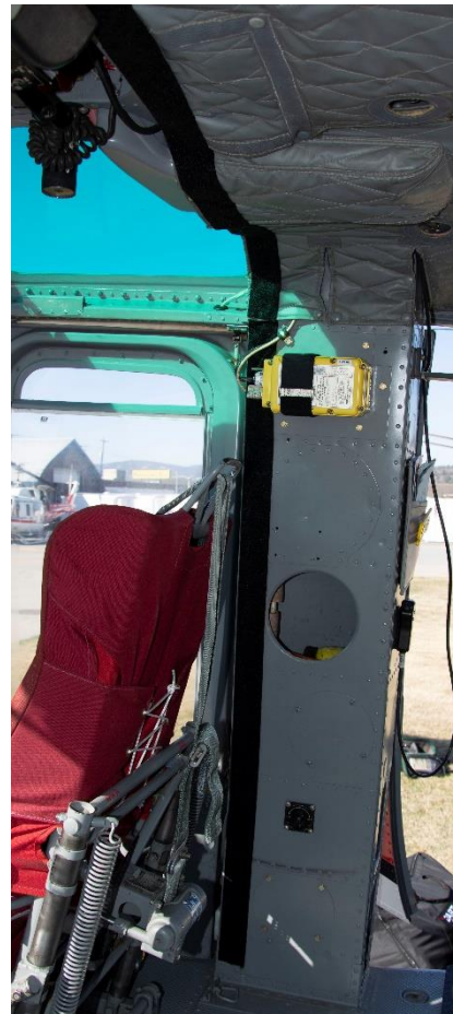
Figure 2 RHS Velcro, Detail (Item 2) Shown